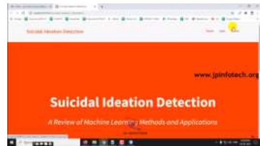
Fig.1. Home page.