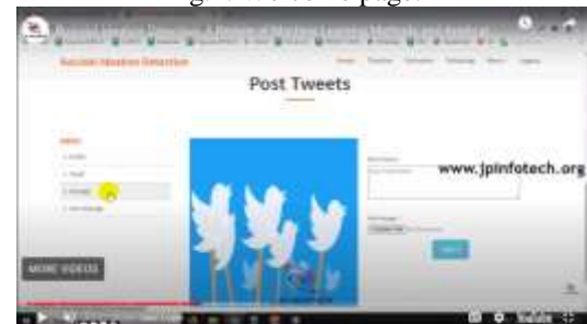
Fig.5. Post tweets page.