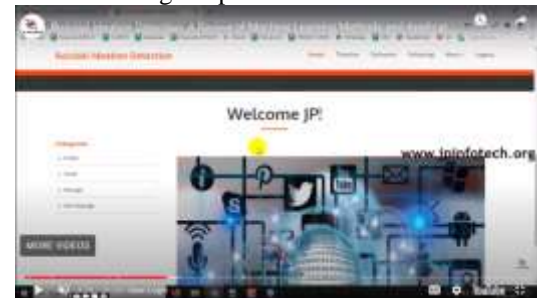
Fig.4. Welcome page.