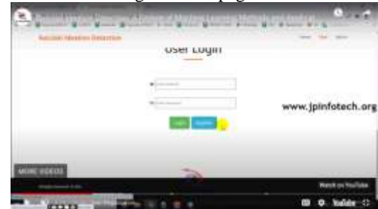
Fig.2. User login page.